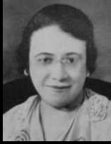
January 29, 1926 – Violette Neatly Anderson the first African American and the first woman appointed to practice law for the Supreme Court of the United States

Violette Neatly Anderson began a private law practice--the first African-American woman to practice law in the U.S. District Court Eastern Division. From 1922 to 1923, she served as the first female city prosecutor in Chicago. After five years of practice before the high court of Illinois, Anderson was admitted to practice for the Supreme Court of the United States, becoming the first African-American woman to attain this stature. Anderson also belonged to the Federal Colored Women's Clubs, was president of Friendly Big Sisters League of Chicago, First Vice-President of Cook County Bar Association, and secretary of Idlewild Lot Owners Association. In addition, she was a member of the executive board of Chicago Council of Social Agencies. She was also the 8th Grand Basileus of Zeta Phi Beta Sorority, Inc. She showed her pride in them by bequeathing her summer home in Idlewild to the organization. Her life is recognized by the Zeta Phi Beta Sorority, Inc., every year in the month of April as "Violette Anderson Day." Violette Anderson died in 1937. For more information visit: http://www.blackpast.org/aah/anderson-violette-neatley-1882-1937