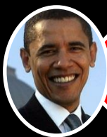
Former President Barack Obama