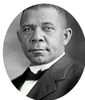
Booker T. Washington

Born to a slave on April 5, 1856, Washington was a great educator and orator who founded the Tuskegee Normal and Industrial