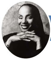
Susan L. Taylor

Susan L. Taylor is an award-winning American editor, writer, journalist and vocal activist within the African --American community. Taylor started her career as a freelance fashion and beauty expert for Essence , a lifestyle magazine for African-American women. She rose to serve as editor-in-chief from 1981 to 2000 before being promoted to publications director. She has several published volumes of her work that has received critical acclaim. In 1994, American Libraries named her “the most influential black woman in journalism today.”