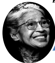
Rosa Louise McCauley Parks (February 4, 1913 –

October 24, 2005) was an African American civil rights activist, whom the United States Congress called "the first lady of civil rights" and "the mother of the Freedom Movement". On December 1, 1955, in Montgomery, Alabama, Parks refused to give up her seat in the colored section of a public transit bus to a white passenger, after the white section was filled. Parks was not the first person to resist bus segregation. Her defiance and the subsequent Montgomery Bus Boycott became important symbols of the modern Civil Rights Movement.